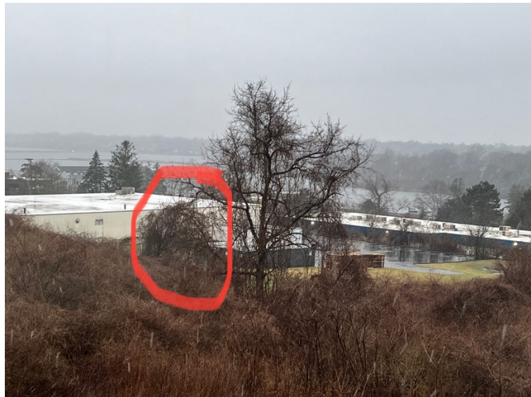
Existing tree in east vegetation line