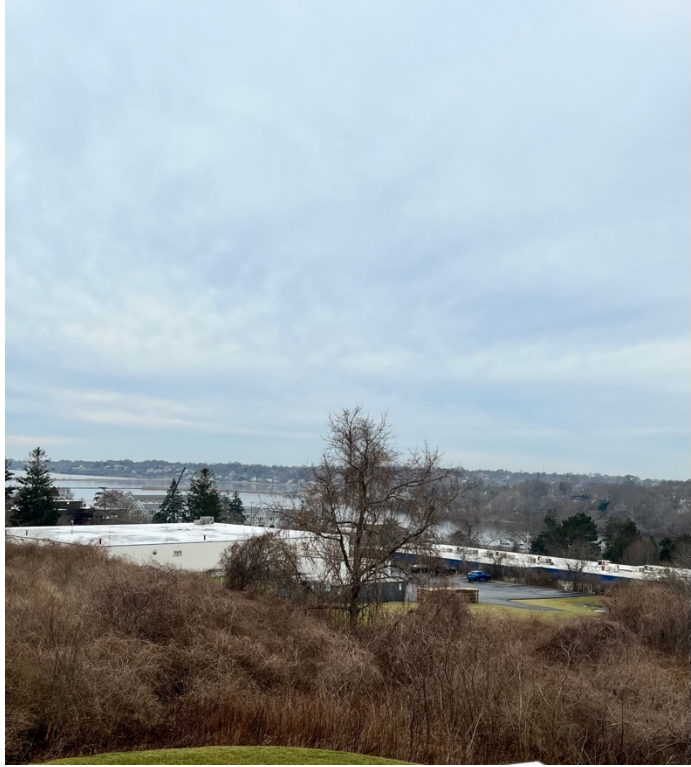
View of site from 12 Julia Court