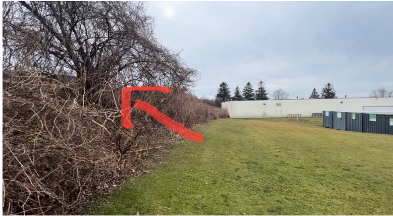
Existing tree in east vegetation line