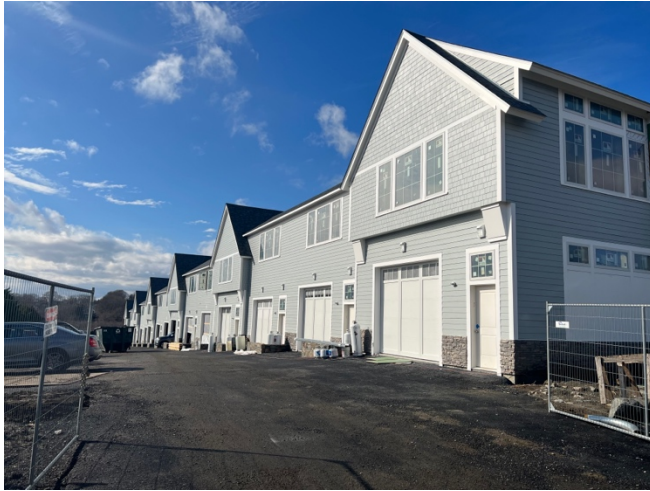
New construction at 55 John Clarke Road with traditional New England design elements and materials.