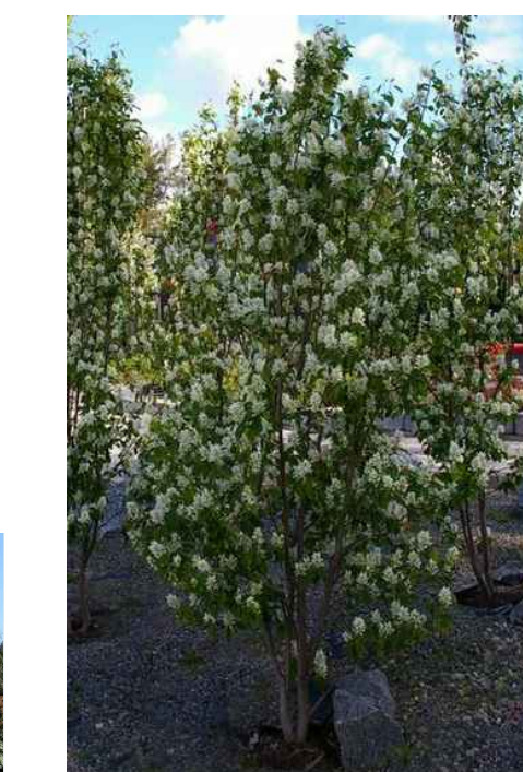
Amelanchier alnifolia 'Obelisk' (AA) Columnar Serviceberry - 12-15'Hx3-4'W. June Flowers. Berries in July. Good fall color