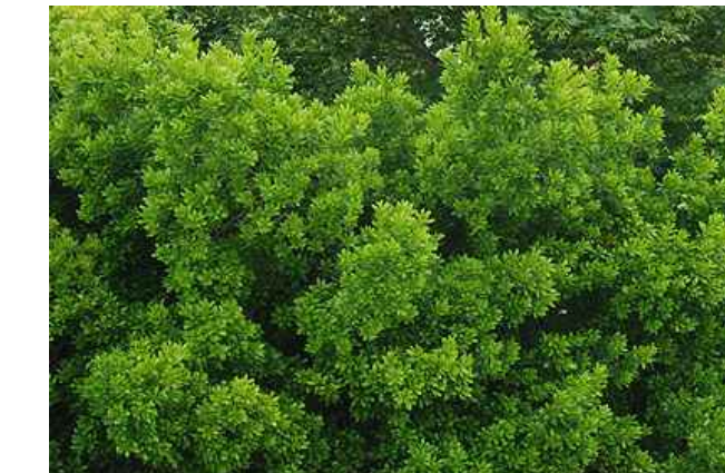
Myrica pensylvanica (MP) - Northern Bayberry 5-10'HxW.