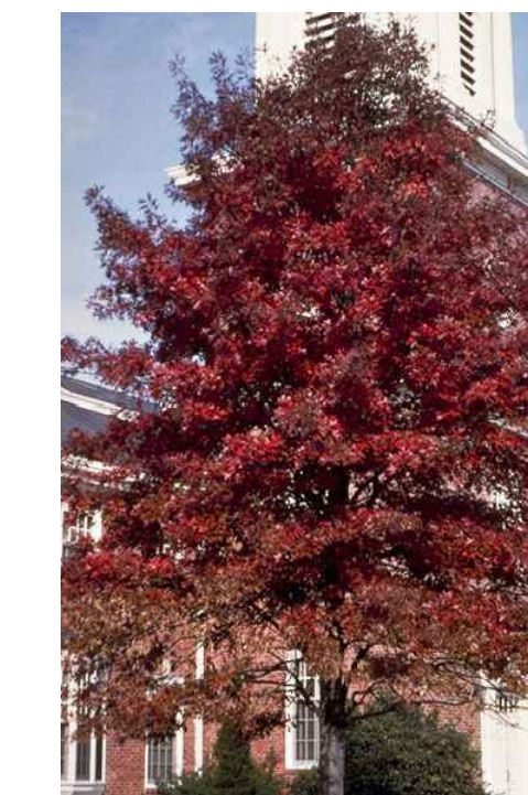
Quercus bicolor (QB) - Swamp White Oak. 50-60'HxW