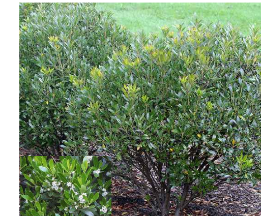
Ilex glabra 'Shamrock' (IG): Inkberry. 3-5'HxW Evergreen shrub.