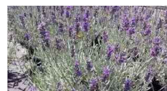
Lavender 'Silver Mist' (LA) 12-18" HxW June-Aug. fragrant blooms. Semi-evergreen