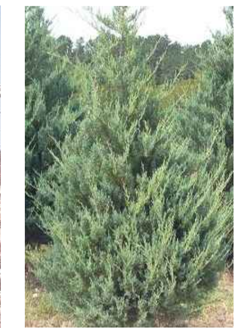
Juniperus virginiana (JV) - Eastern Red Cedar. 30'Hx10'W