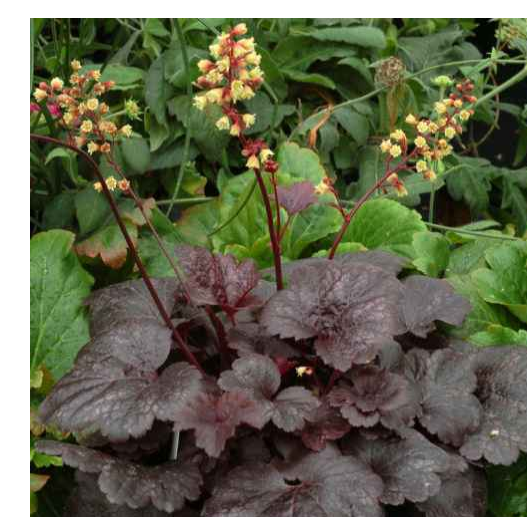
Heuchera 'Gotham' (HG) Coralbells, Yellow blooms all season. 12-18"x24"