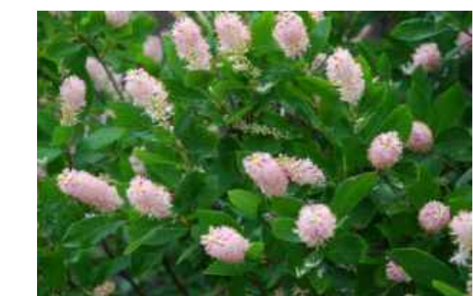
Clethra alnifolia 'Pink Spire' - (CA) Dwarf Summersweet Fragrant, bottlebrush flowers late summer/early fall. 3-5'HxW