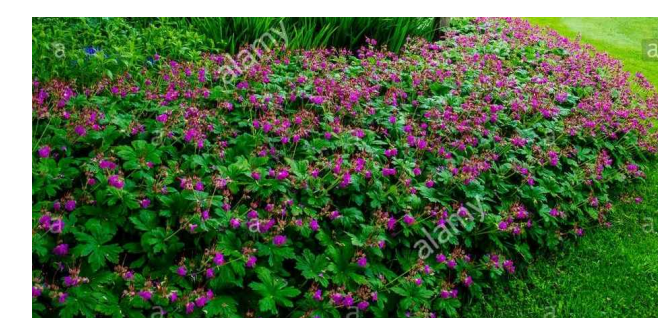
Geranium macrorrhizum 'Czakov' - (GM) Cranesbill 12'Hx2-3'W Semi-evergreen. Spring-summer blooms