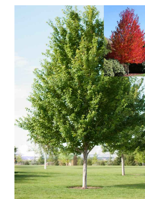
Acer rubrum (AR) 'Redpoint' - Redpoint Maple 45'Hx30'W