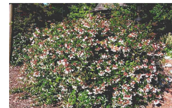
Abelia x 'Edward Goucher' (AE) Semi-evergreen, long blooming. 3-5'HxW