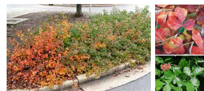
Rhus aromatica 'Gro Low' (RA) Dwarf Fragrant Sumac. 2'Hx6-8'W. Yellow early spring flowers.