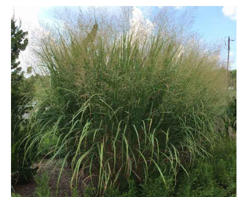
Panicum virgatum 'Thundercloud' - Tall Switchgrass. 7'HxW