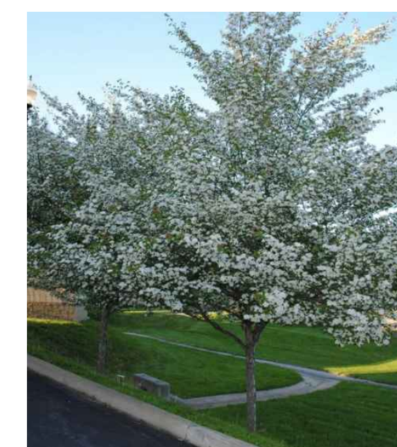
Crataegus viridis 'Winter King' (CV)- Green Hawthorn 20-25'hxW. Persistent red fruits. White flowers mid-May