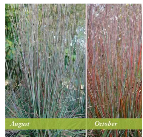
Schizachyrium s. 'Standing Ovation' (SS) Little Bluestem Grass. 2-4'Hx18'W