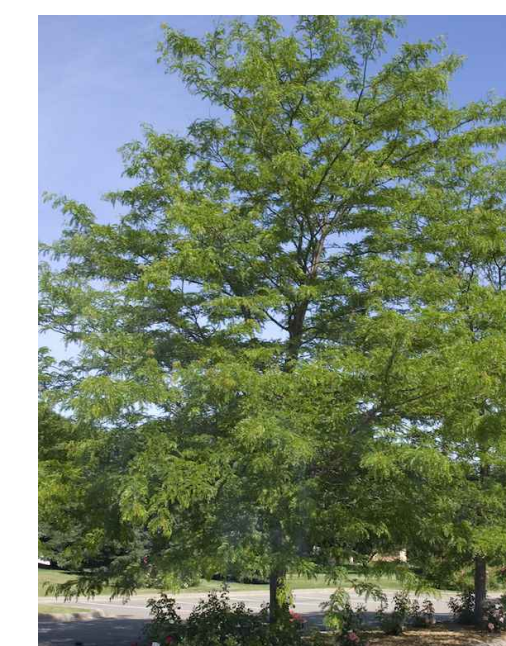
Gleditsia triacanthos 'Shademaster' (GT)- Honeylocust. Small leaves blow away. Yellow fall foliage.