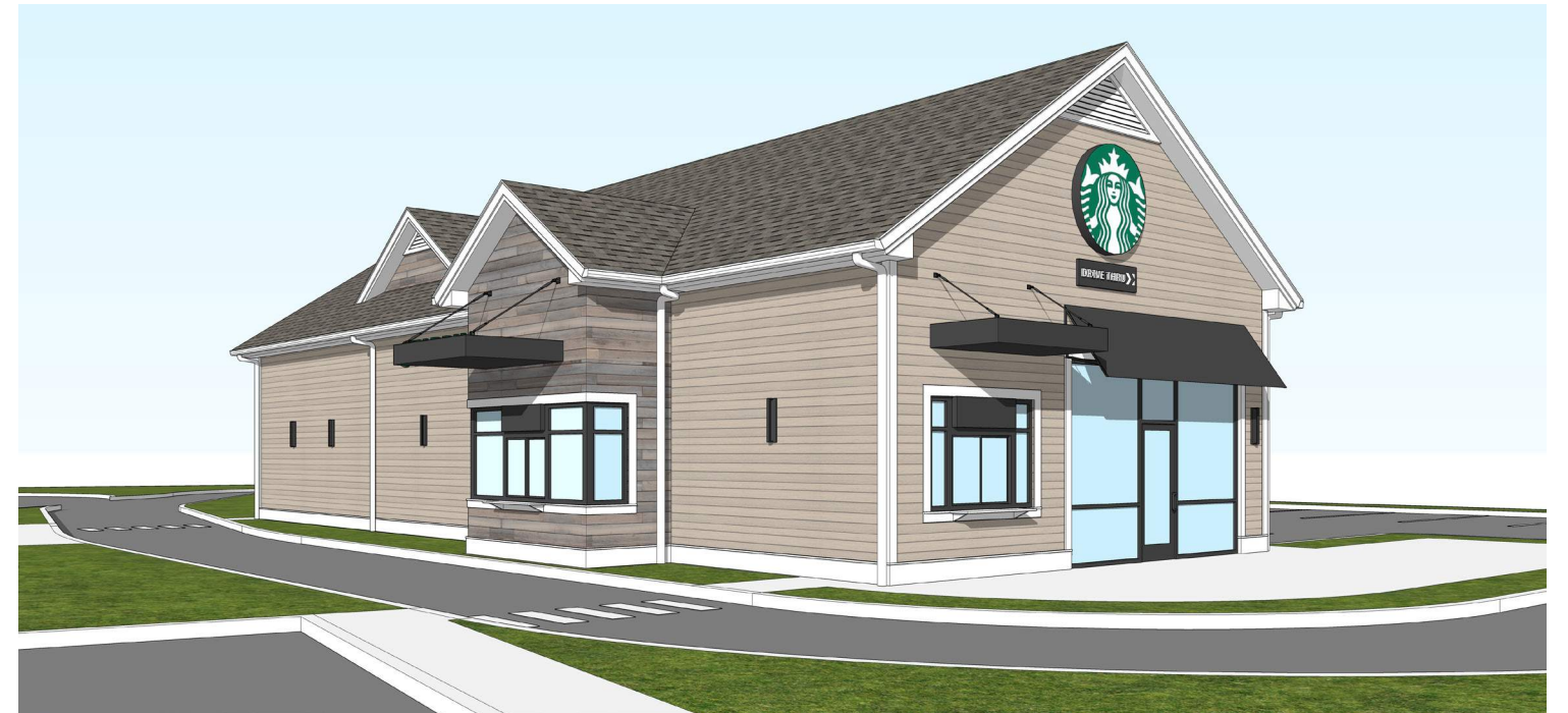
Perspective View of South-East Building Corner