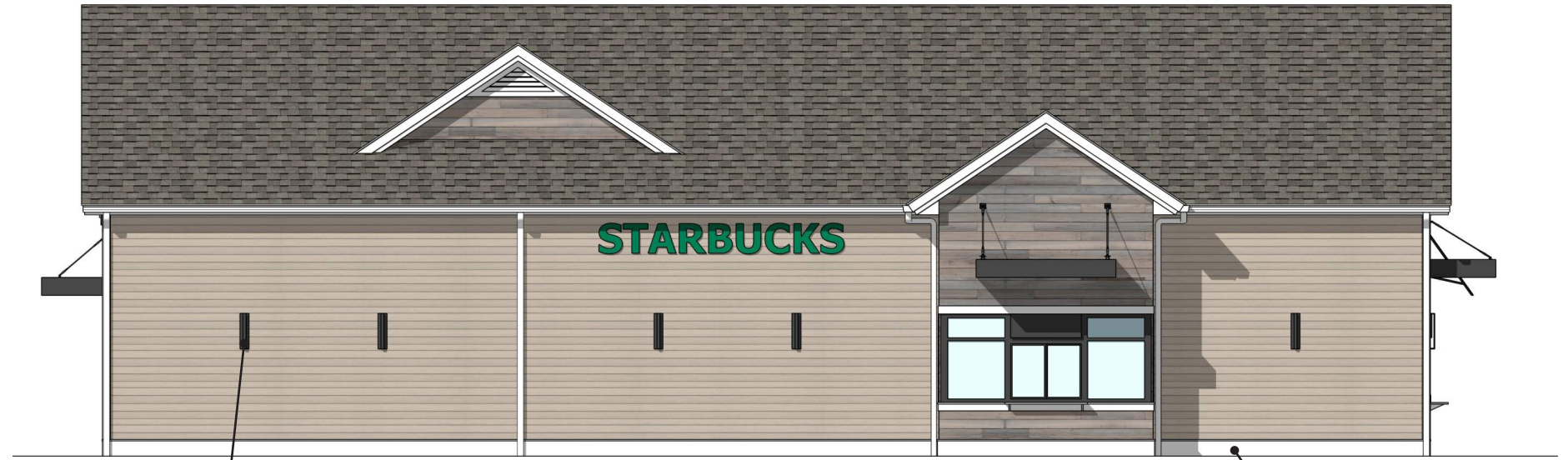
Proposed South Elevation (not to scale)