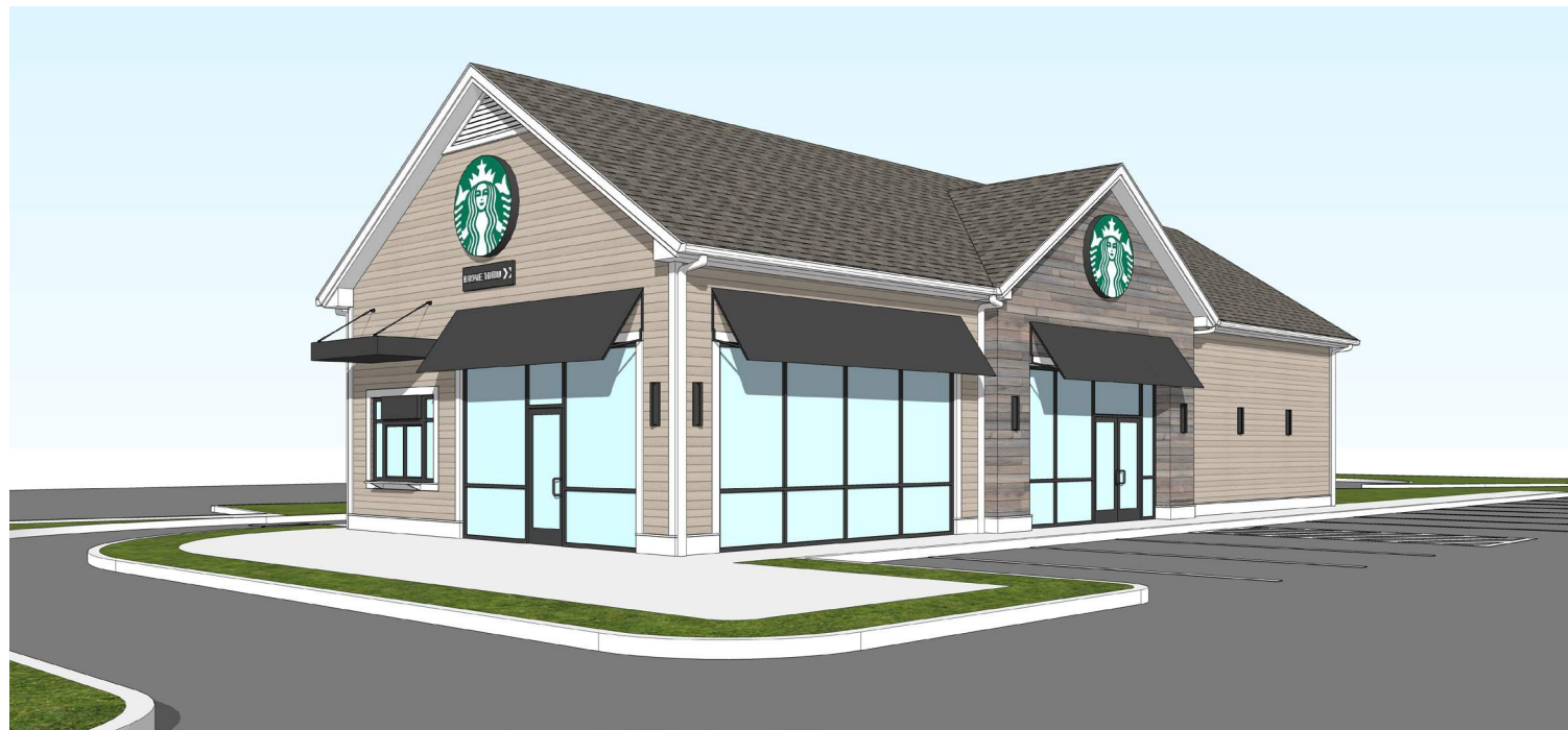
Perspective View of North-East Building Corner