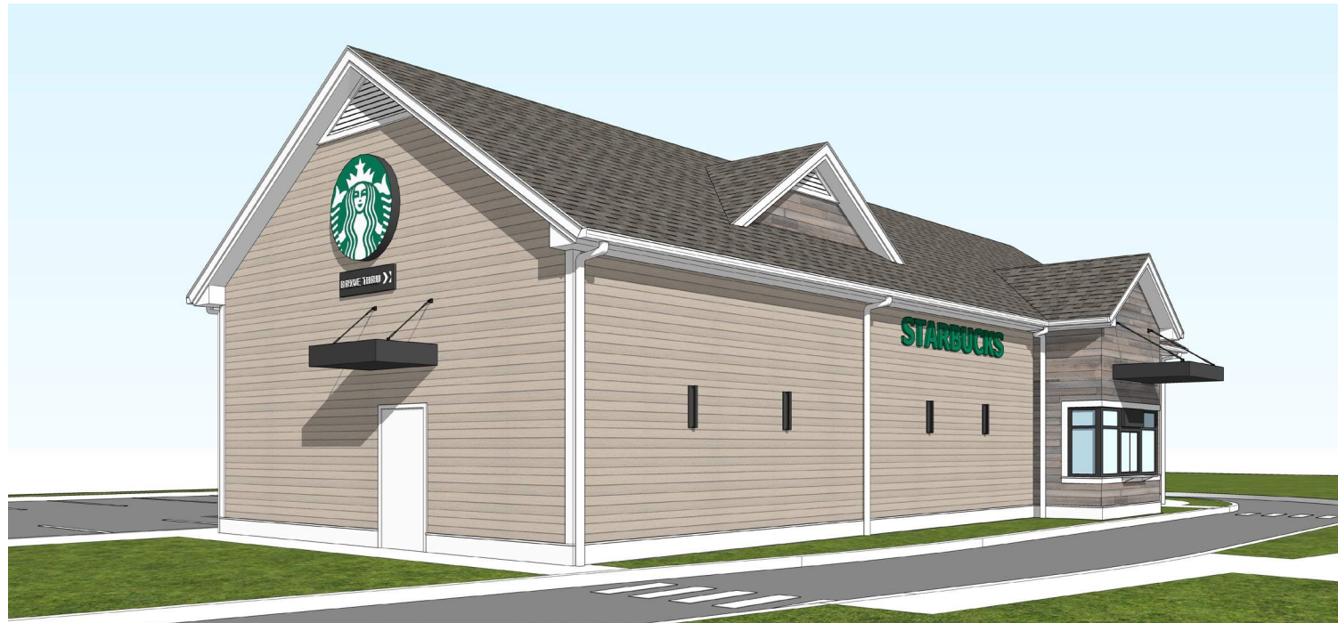
Perspective View of South-West Building Corner