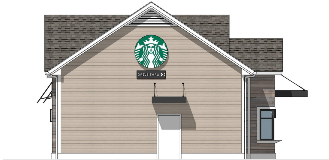
Proposed West Elevation (not to scale)