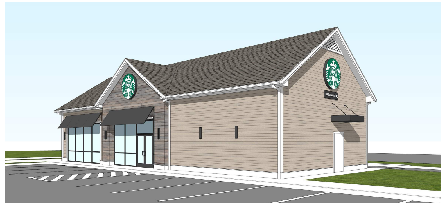
Perspective View of North-West Building Corner