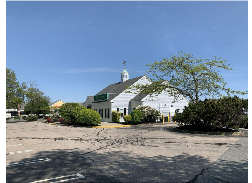
Photos of Existing Buildings At Aquidneck Shopping Centre