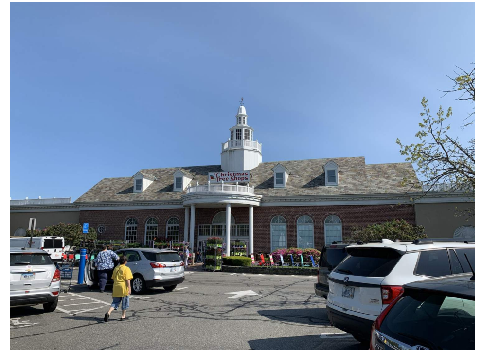
Photos of Existing Buildings At Aquidneck Shopping Centre