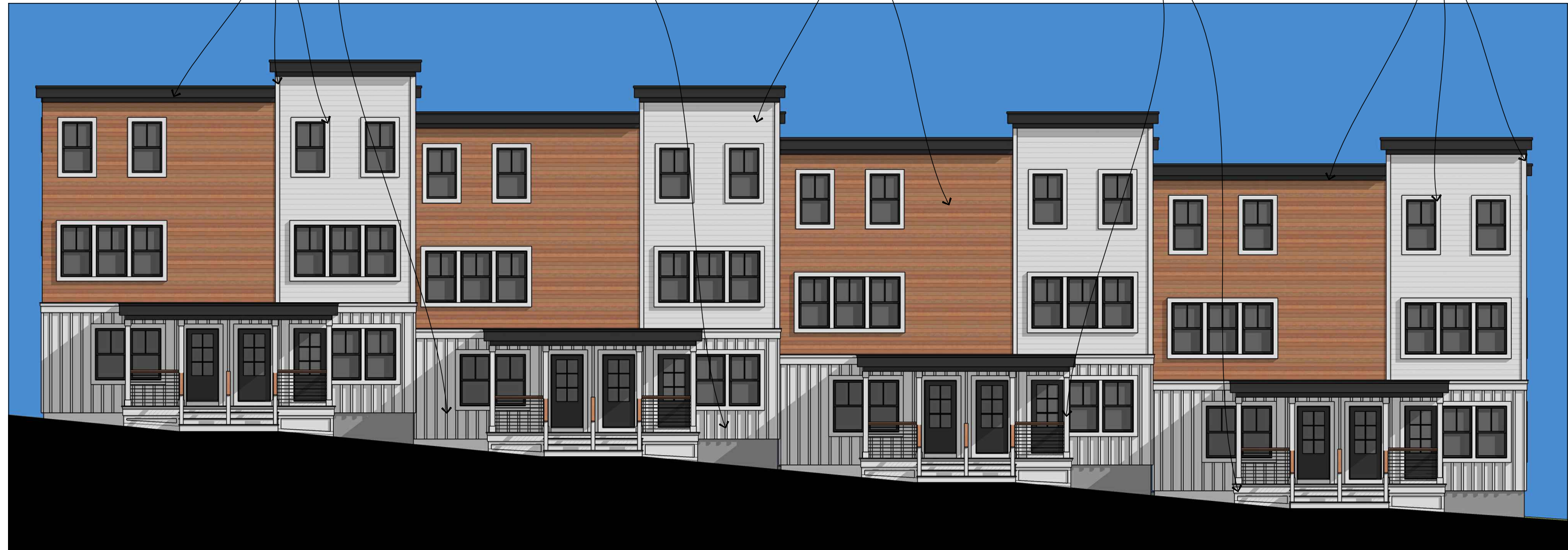
1 NORTH ELEVATION PERCENTAGE OF WINDOWS TO EXTERIOR WALL = 18.6% SCALE: 3/32" = 1'-0"

TRIM & CORNERBOARDS— AZAK WHITE AND NATURAL ULTRASHIELD IN SPANISH WALNUT TRIM COMPONENTS