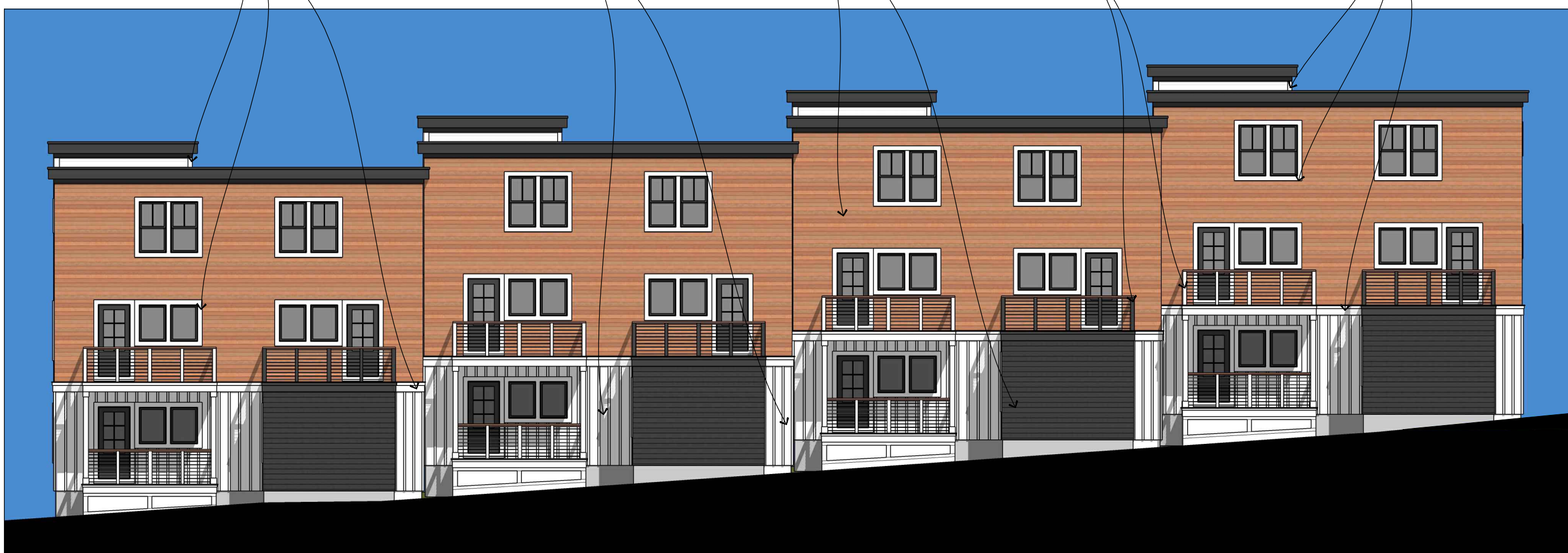
1 SOUTH ELEVATION SCALE: 3/32" = 1'-0"

TRIM & CORNERBOARDS— AZAK WHITE AND NATURAL ULTRASHIELD IN SPANISH WALNUT TRIM COMPONENTS