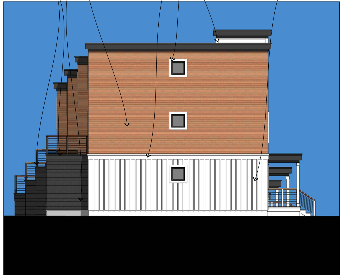
1 WEST ELEVATION SCALE: 3/32" = 1'-0"