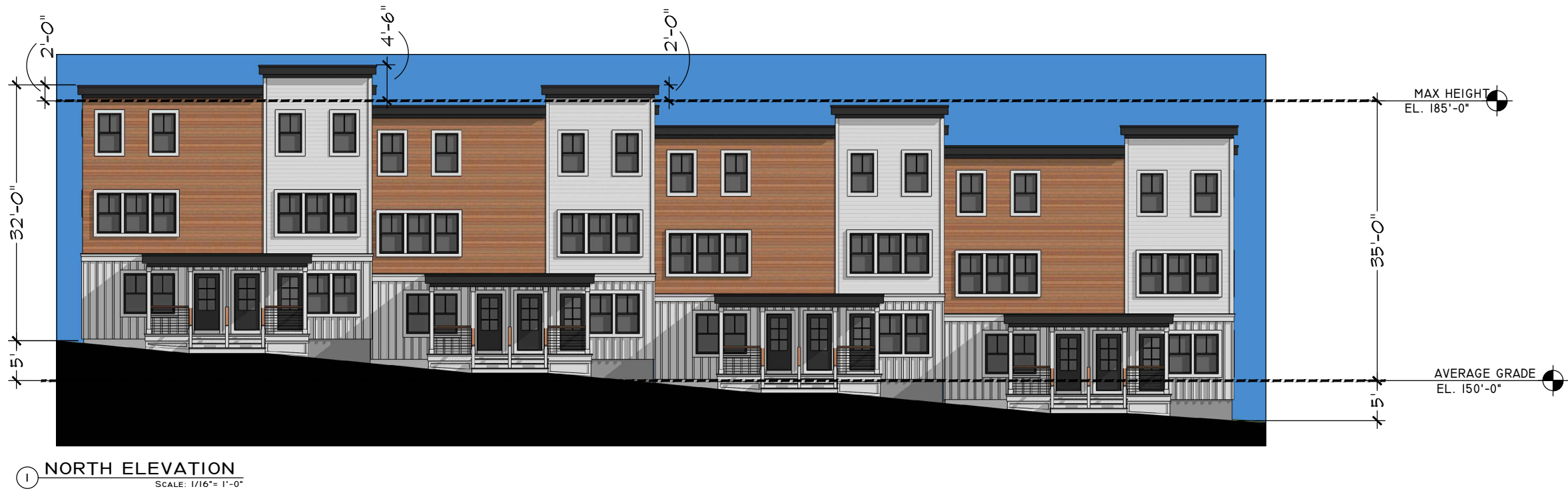
1 NORTH ELEVATION SCALE: 1/16" = 1'-0"

2021 COPYRIGHT. THIS DRAWING IS NOT TO BE USED FOR MARKING AND REPRODUCTION WITHOUT THE WRITTEN AUTHORIZATION FROM CORDISEN ARCHITECTURE, INC.