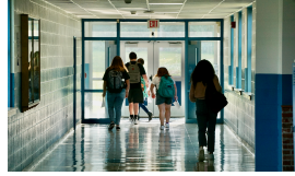
SCHOOL UPGRADES DISCUSSED