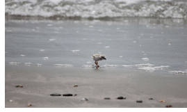
GOOD NEWS FOR PLOVERS