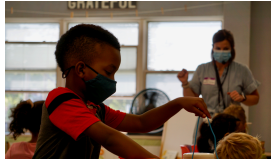
STRONG OPENING FOR SCHOOLS