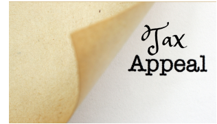
TAX APPEALS LIVE NOW